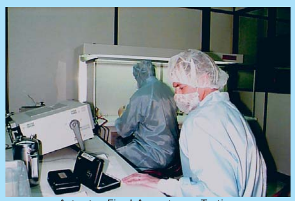
Actuator Final Acceptance Testing