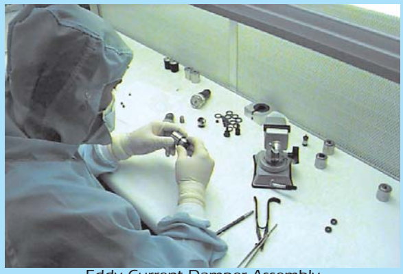
Eddy Current Damper Assembly